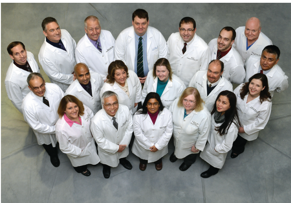
2014 Medical Arts Clinic medical staff