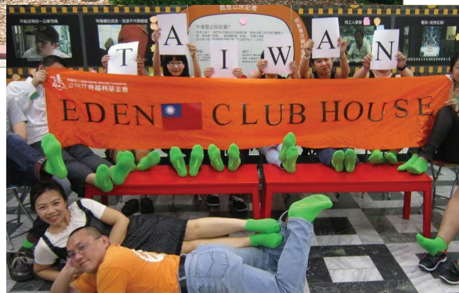
Right: “Kick the Stigma” reaches the Eden Clubhouse in Taiwan!